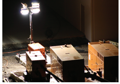
Diesel, Electric & Battery Powered Light Towers