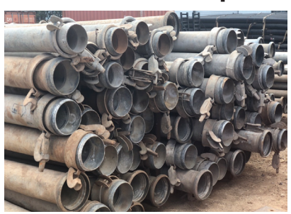
QD Piping, HDPE Piping, Hoses, & Fittings