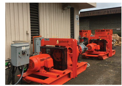
Electric Dri-Prime & Submersible Pumps