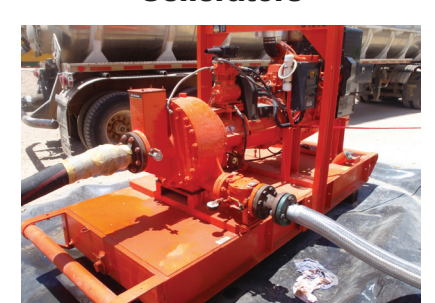
High Head Pumps for Temp Fire and Cleaning