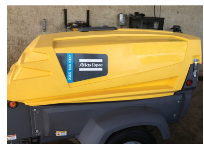
Portable & Industrial Air Compressors