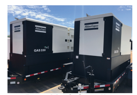
Portable & Standby Generators