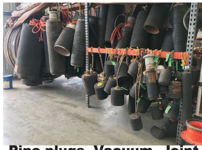
Pipe plugs, Vacuum, Joint & Mandrel Testers